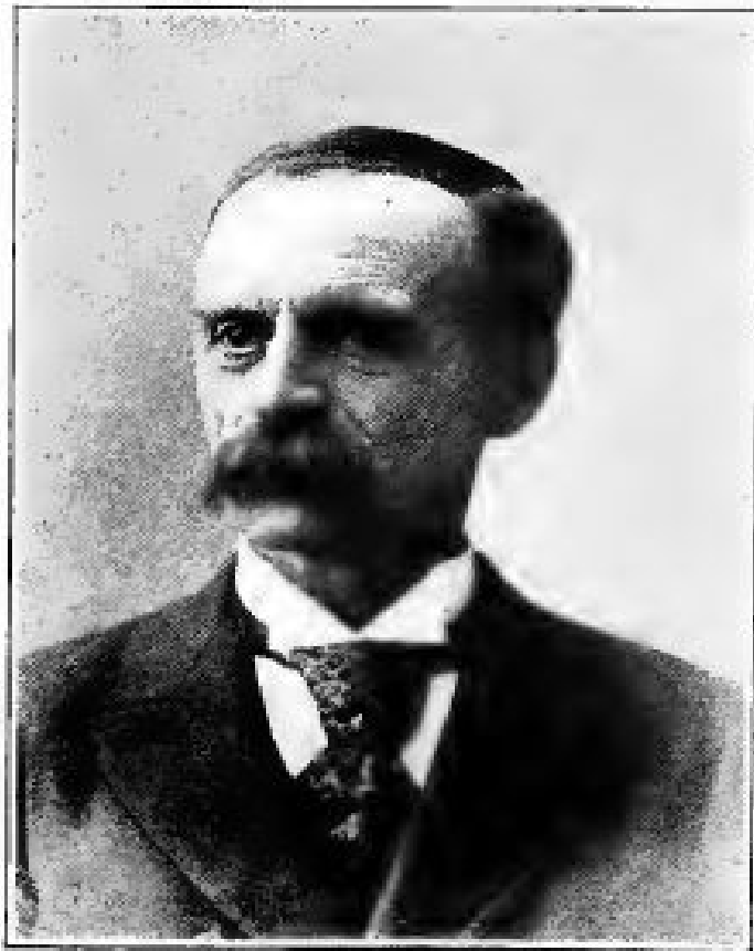
JUDGE JEROME E. PORTER.